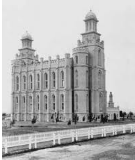
Figure 15 Logan, Utah Temple 418

Many Shoshones and Paiutes during the last quarter of the nineteenth century identified with the sacred Mormon myths they encountered in the Book of Mormon. Ech-up-way's vision tapped into ancient Newe practices. Some Native Americans used the same impulse to launch militant resistance, while others participated in the Ghost Dance. Sagwitch's Shoshones "interpreted [the impulse] as a sign to seek power" through the Mormons who seemed to understand the world in a similar way. Thus, Smoak, echoing Richard White, maintains that "Indians like Sagwitch and Ech-up-way and white Mormons like Hill created a religious middle ground, a set of creative misunderstandings that, at least for the moment, brought them together." 419 Certainly wide differences also divided the two cultures, but the northwestern Shoshones found enough in common to retain Mormonism as part of their worldview into the twenty-first century.