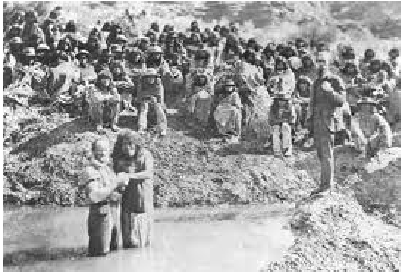
Figure 14 Baptizing Shivwits in St. George, Utah 1875 415

stealing.” 412 Fifteen years later, General Nelson Miles, commenting on the 1890 Ghost Dance, wrote, “I cannot say positively, but it is my belief the Mormons are the prime movers in all this...It will [probably not] lead to an outbreak, but when an ignorant race of people become religious fanatics it is hard to tell just what they will do.” 413 Coates argues that such accusations played into the general hysteria over Mormons during the polygamy controversy and that while some Mormon ideas may have influenced Ghost Dancers, the effect seemed peripheral rather than central. 414