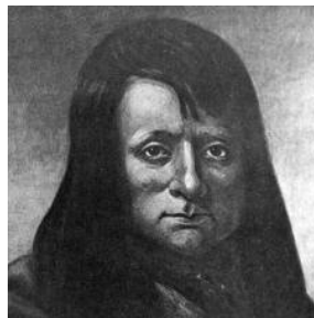
Figure 4 “Wacarra, Ute Chief.” 163

negotiator Wakara deflected Mormon requests from Brigham Young and others to stop raiding other tribes and Mexicans. “My men hate the Spaniards,” he contended, “they will steal from them and I cannot help it.” But he insisted that his people “love your people and they will not steal from you, and if any of the bad boys do, I will stop them.” By claiming an inability to stop his “uncontrollable” men Wakara could maintain the flow of horses and cattle raided from New Mexico and California to continue a healthy balance of trade for Mormon goods, while placating Mormon fears that his warriors would cause them any harm.