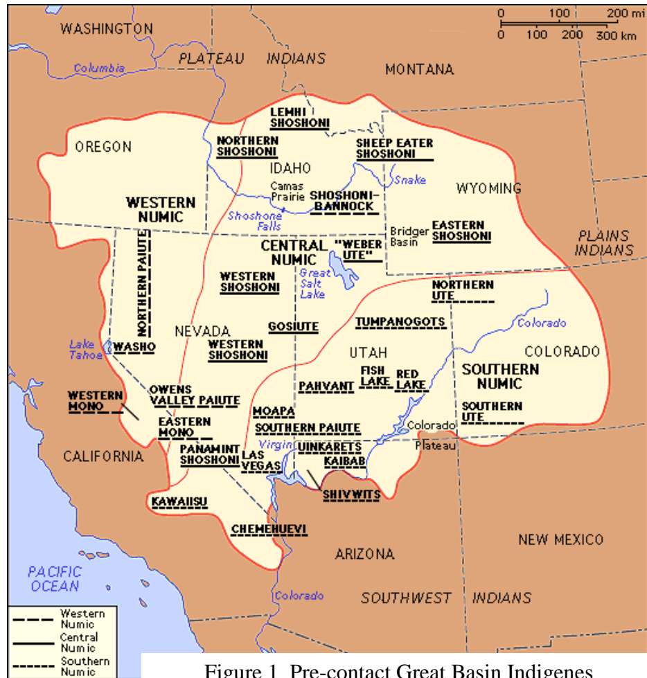
Figure 1 Pre-contact Great Basin Indigenes