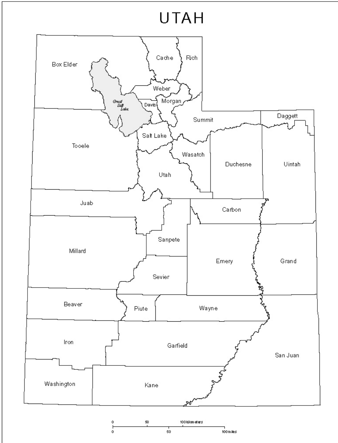
Map 1 Utah County Map