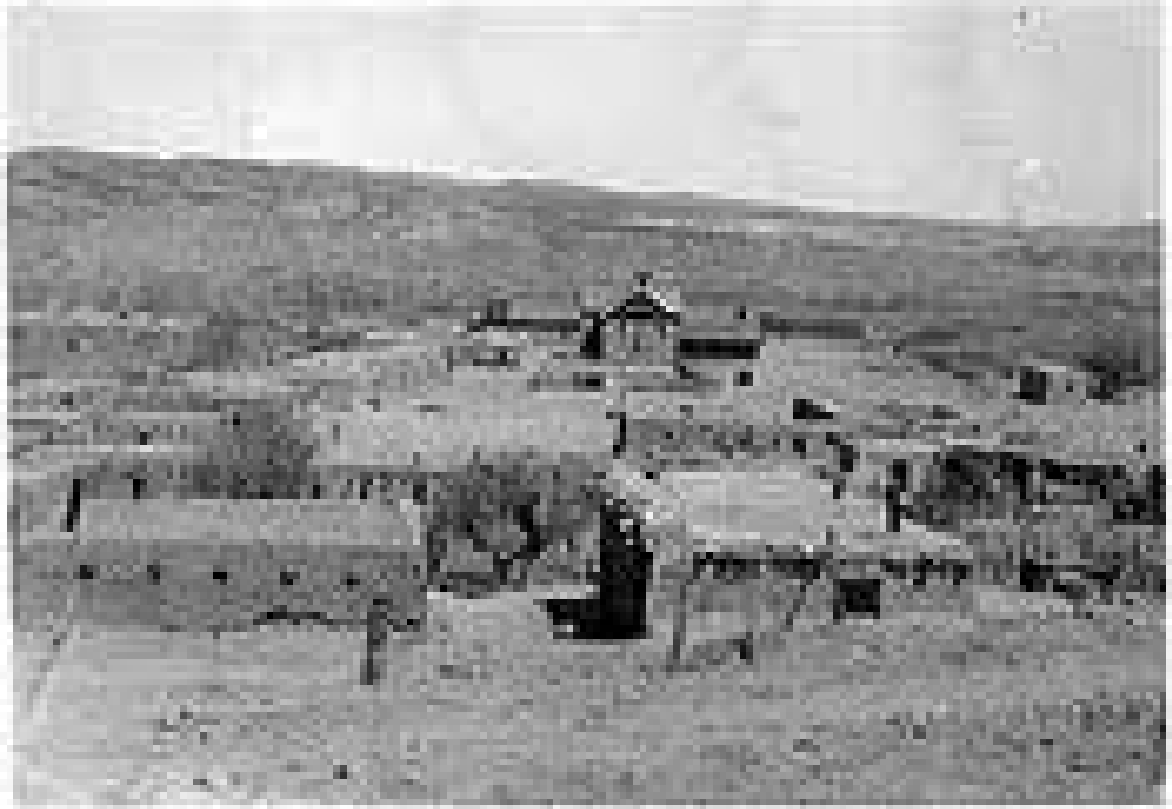
Figure 5 Abiquiu, New Mexico 215